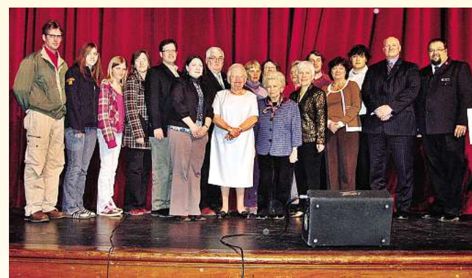
Swing into Spring