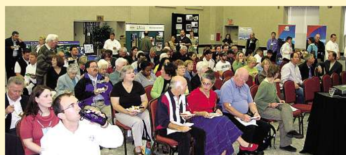
Drinking Water, Challenges Today and Tomorrow