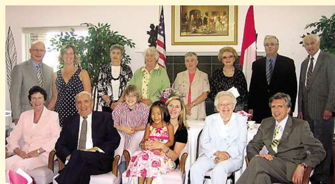
Donor Appreciation Tea