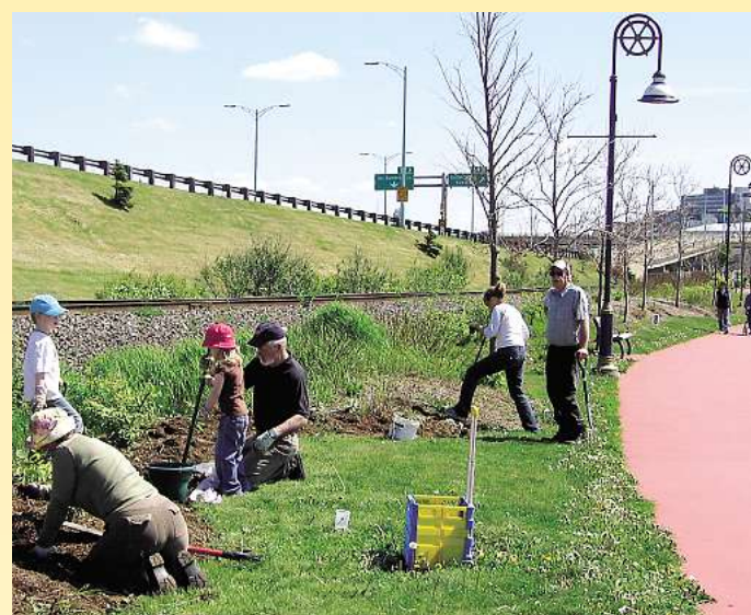
6th Annual Harbour Passage Garden Party