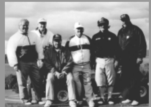
"Granny" & some golfing friends