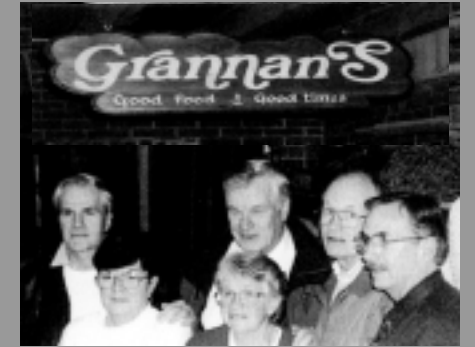
The Grannans dine out