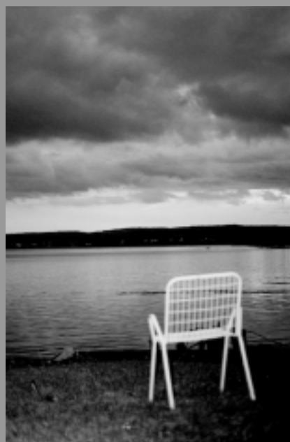
Sunset in St. Andrew's