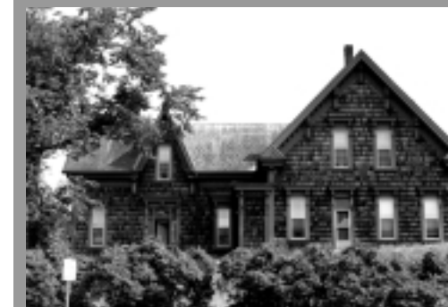
The Grannan home on Rockland Rd.