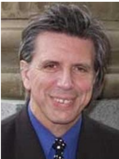
His Honour Herménégilde Chiasson Former Lieutenant-Governor, Province of New Brunswick